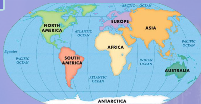
Continents and Oceans