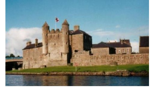
Enniskillen Castle, Northern Ireland