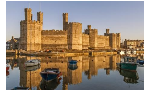
Caernarfon Castle, Wales