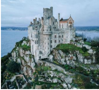
St. Michael's Mount