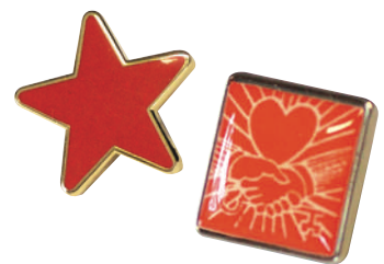
Kindness, Consideration and Respect