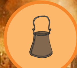
leather water bucket