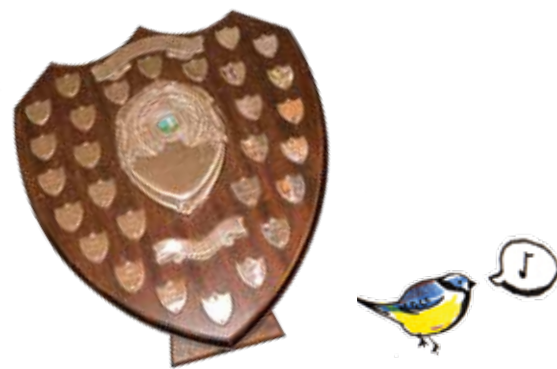
Six consecutive years as Cornwall Cricket Champions