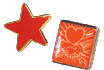
Kindness, Consideration and Respect